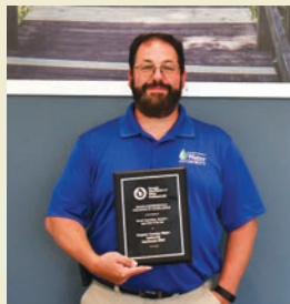
Biosolids/Residuals Program of Excellence Award