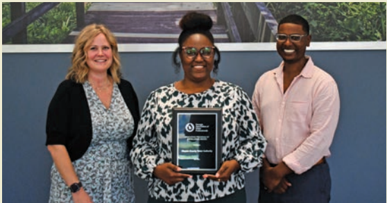
Education Program of Excellence Award