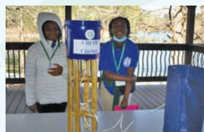
Award for Structural Excellence