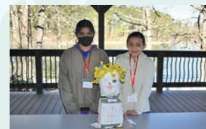
Best Engineering Design