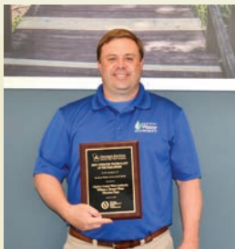
Best Operated Water Treatment Plant Award

Shoal Creek Water Reclamation Facility and Northeast Water Reclamation Facility were awarded Gold Awards for 100 percent compliance in 2022.