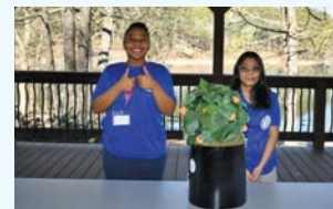
Outstanding Presentation/ Judge's Choice