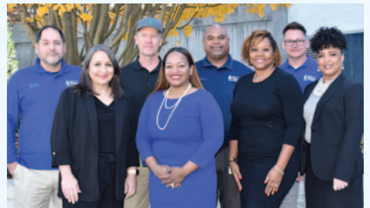
Human Resources Team

These awards recognize the overall quality, accomplishments, and contributions of an agency human resource program that exceeds the normal operation of a "good government human resource program."