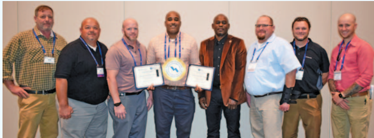
Distribution & Conveyance Maintenance Staff