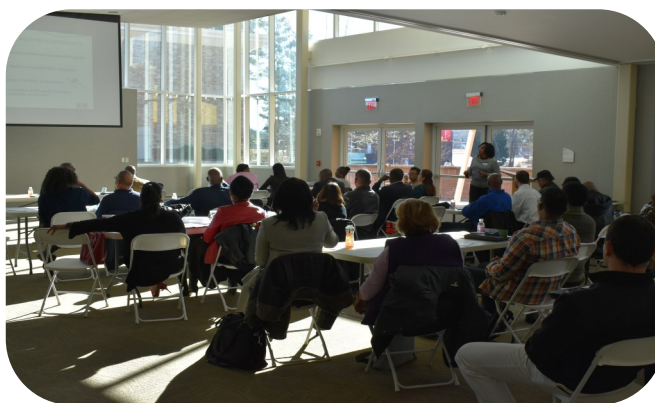
January 2018 SLBE Information Session