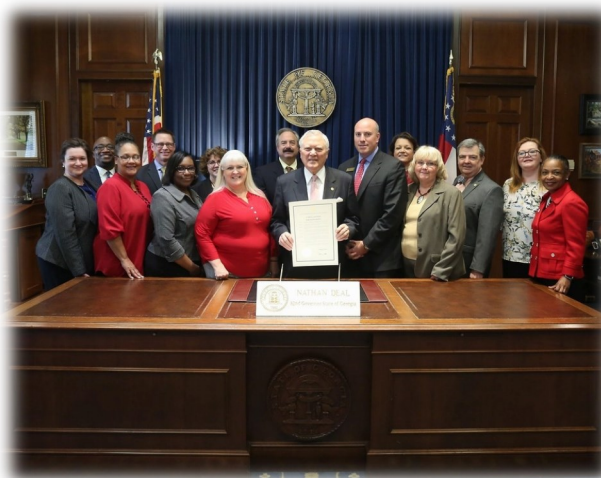
Governor Nathan Deal Proclaims Procurement Month

the shift towards strategic sourcing, e-procurement bid and vendor management software save the organization time so that it can focus on organization initiatives and supplier relationships. SourceSuite's cloud-based bid and supplier management platforms configure to meet the purchasing needs of virtually any organization. Currently, SourceSuite streamlines the purchasing process for over 900 buying organizations across the country.