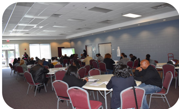
A great turnout for the Accurate and Competitive Pricing workshop. Thirty-Five (35) small business owners were in attendance.