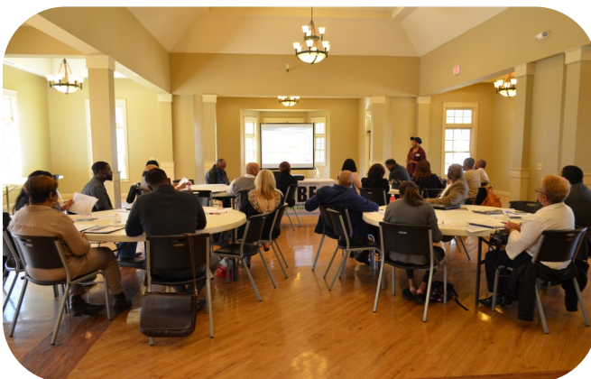
March 2018 SLBE Information Session