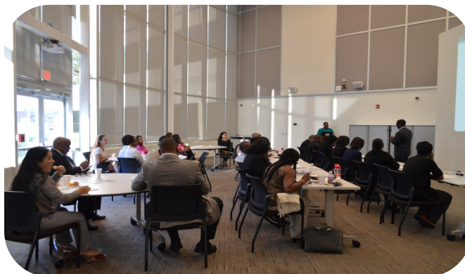
October 2017 SLBE Information Session