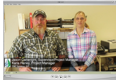
C & C Lovejoy, LLC

Click on each video to view the spotlighted SLBE firms. YOU COULD BE NEXT!